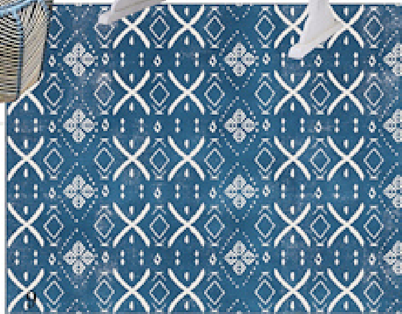
1. Joris et Cie - Amari high back lounge chair / 2. Azurro Living - Calamus club chair / 3. Slovene Design - Rio armchair / 4. Lillian August - Marseille chair / 5. Castelle - Preserve lounge chair / 6. Padmas Rattan - Oasis end table / 7. Kingsley Bate - Oslo table / 8. Medway - Freeport collection / 9. Tempaper - Mudcloth Indigo vinyl floor rug