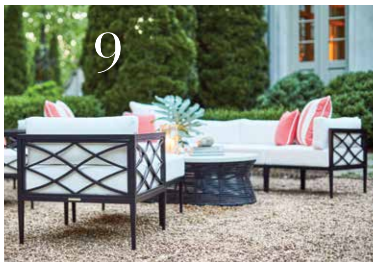
9 ELEGANTE COLLECTION FROM SUMMER CLASSICS; A modern take on European furniture, crafted from premium wrought iron; side chair, $919; sofa $4,874; summerclassics.com