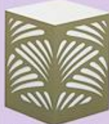
Metro collection table lamp