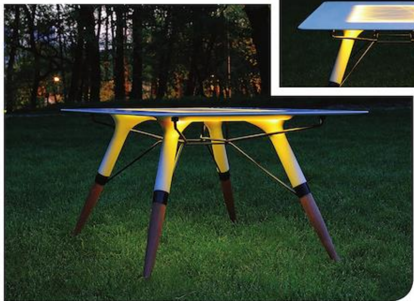
Dsignedby Light up the football fare during a night game gathering with the Table T. Combining a smooth Corian tabletop and luminosity from a built-in LED strip under the surface, this contemporary table not only glows, but serves as a warming tray throughout the game. dsignedby.com