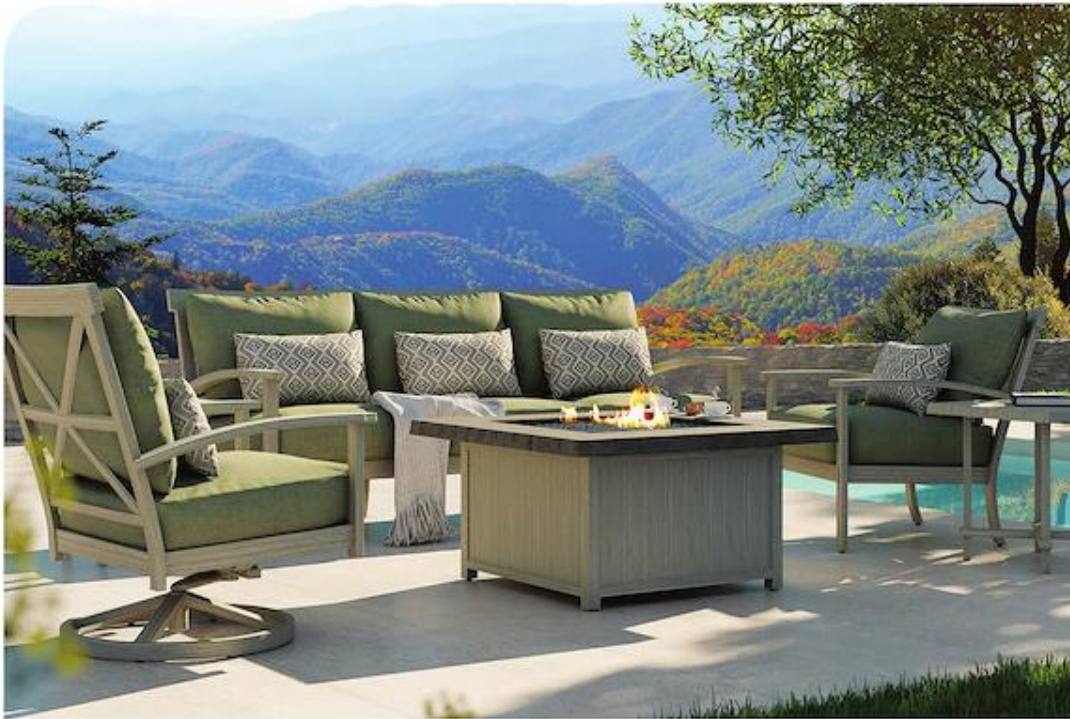
Castelle Cool autumn nights can heat up when friends and fans gather near the Biltmore Antler Hill fire pit. Constructed of durable aluminum, it boasts ample room for laying out game time goodies. castelleluxury.com